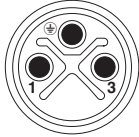
Pin assignment of M12 plug, 3-pos., S-coded, view of pin side