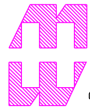
VIEW OF LID (INSIDE)