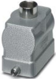
HEAVYCON B10 sleeve housing, for single locking latch, height: 56 mm, with 1 x Pg16 gland, straight cable outlet

Please be informed that the data shown in this PDF Document is generated from our Online Catalog. Please find the complete data in the user's documentation. Our General Terms of Use for Downloads are valid ( http://download.phoenixcontact.com )