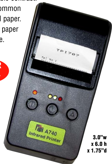
3.0" w x 6.0 h x 1.75" d