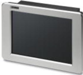
IPC with touch screen

Please be informed that the data shown in this PDF Document is generated from our Online Catalog. Please find the complete data in the user's documentation. Our General Terms of Use for Downloads are valid ( http://download.phoenixcontact.com )