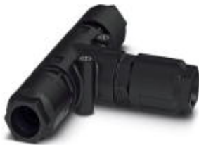
QUICKON T-distributor, black, 4+PE-pos., 2.5 mm 2 ... 6.0 mm 2 /690 V/40 A, for cable diameter of 12 mm ... 20 mm, with three QUICKON nuts

Please be informed that the data shown in this PDF Document is generated from our Online Catalog. Please find the complete data in the user's documentation. Our General Terms of Use for Downloads are valid ( http://phoenixcontact.com/download )