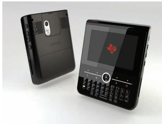
ZOOM OMAP34x-II MOBILE DEVELOPMENT PLATFORM

At the heart of the Zoom OMAP34x-II MDP is Texas Instruments' OMAP3430 applications processor that combines powerful multimedia, graphics, and imaging capabilities with a high-