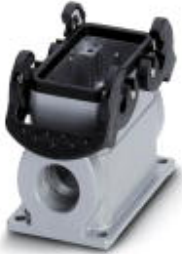
HEAVYCON box mounting base B10, with double locking latch, height 74 mm, with support 2xM32

Please be informed that the data shown in this PDF Document is generated from our Online Catalog. Please find the complete data in the user's documentation. Our General Terms of Use for Downloads are valid ( http://phoenixcontact.com/download )