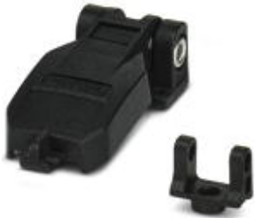
Protective covers, contact inserts: x , degree of protection: IP65/67

Please be informed that the data shown in this PDF Document is generated from our Online Catalog. Please find the complete data in the user's documentation. Our General Terms of Use for Downloads are valid ( http://phoenixcontact.com/download )