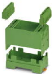
Electronic housing set, consisting of electronic housing and printed circuit termination blocks, pitch 5

Please be informed that the data shown in this PDF Document is generated from our Online Catalog. Please find the complete data in the user's documentation. Our General Terms of Use for Downloads are valid ( http://phoenixcontact.com/download )