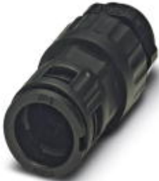
Cable gland, metric thread, IP66 protection, with strain relief

Please be informed that the data shown in this PDF Document is generated from our Online Catalog. Please find the complete data in the user's documentation. Our General Terms of Use for Downloads are valid ( http://phoenixcontact.com/download )