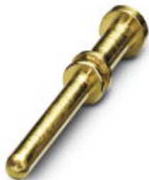
Crimp contact, turned, Single contact, contact diameter: 2 mm, crimp range: 4 mm 2 ... 4 mm 2

Please be informed that the data shown in this PDF Document is generated from our Online Catalog. Please find the complete data in the user's documentation. Our General Terms of Use for Downloads are valid ( http://phoenixcontact.com/download )