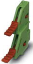
Ejectors, for assembly on each side of the header

Please be informed that the data shown in this PDF Document is generated from our Online Catalog. Please find the complete data in the user's documentation. Our General Terms of Use for Downloads are valid ( http://phoenixcontact.com/download )