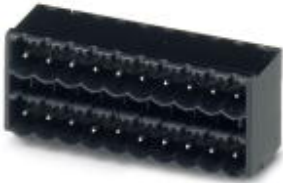
The figure shows a 10-pos. version with 20 contacts

Header, Nominal current: 12 A, Rated voltage (III/2): 400 V, Number of positions: 2, Pitch: 5 mm, Color: black, Contact surface: Tin, Assembly: Taped SMD/THT/THR components