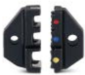
Spare die for CRIMPFOX-RCI 6

Replacement die - CRIMPFOX-RCI 6/DIE - 1212058