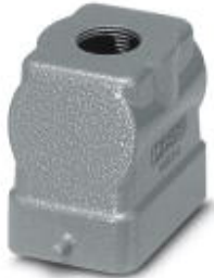
HEAVYCON B6 sleeve housing, for single locking latch, height: 56 mm, with 1 x M20 thread, straight cable outlet

Please be informed that the data shown in this PDF Document is generated from our Online Catalog. Please find the complete data in the user's documentation. Our General Terms of Use for Downloads are valid ( http://phoenixcontact.com/download )