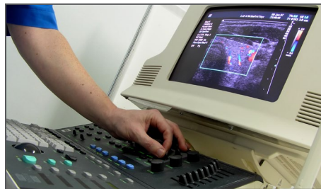
Portable Ultrasound Equipment