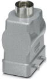
HEAVYCON B10 sleeve housing, for double locking latch, height: 72 mm, with 1 x M25 gland, straight cable outlet

Please be informed that the data shown in this PDF Document is generated from our Online Catalog. Please find the complete data in the user's documentation. Our General Terms of Use for Downloads are valid ( http://download.phoenixcontact.com )