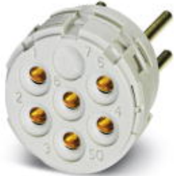
Contact insert, Number of positions: 17, Type of contact: Socket, Solder-in connection

Please be informed that the data shown in this PDF Document is generated from our Online Catalog. Please find the complete data in the user's documentation. Our General Terms of Use for Downloads are valid ( http://phoenixcontact.com/download )