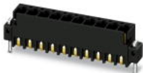
The figure shows the 10-position version

PCB headers, nominal current: 6 A, rated voltage (III/2): 160 V, number of positions: 9, pitch: 2.54 mm, color: black, contact surface: Gold, mounting: SMD soldering, Fixed coding of the last position, can be combined with the FMC 0,5/...-ST-2,54 C2 connector