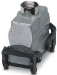
HEAVYCON B16 coupling housing, with double locking latch, height: 82 mm, with 1 x M32 gland, straight cable outlet

Please be informed that the data shown in this PDF Document is generated from our Online Catalog. Please find the complete data in the user's documentation. Our General Terms of Use for Downloads are valid ( http://download.phoenixcontact.com )