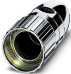
Sleeve housing for cable connector, straight, Screw locking, M23, Shielded: No, Cable cross section: 3 mm...10 mm

Please be informed that the data shown in this PDF Document is generated from our Online Catalog. Please find the complete data in the user's documentation. Our General Terms of Use for Downloads are valid ( http://download.phoenixcontact.com )