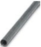
Protective hose in stainless steel

Protective hose - WP-STEEL S 45 - 3240690