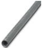
Protective hose in galvanized steel

Protective hose - WP-STEEL ZC 45 - 3240701