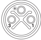
Pin assignment of M12 socket, 3-pos., S-coded, socket side view