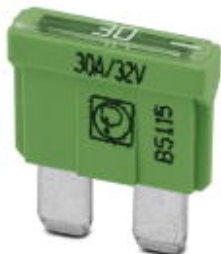
Flat-type plug-in fuse, type C, color code: light green, nominal current: 30 A

Please be informed that the data shown in this PDF Document is generated from our Online Catalog. Please find the complete data in the user's documentation. Our General Terms of Use for Downloads are valid ( http://phoenixcontact.com/download )