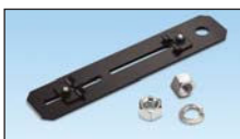
FR6TRBN12 FR6TRBN58 FR6TRBN12M FR6TRBN58M