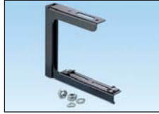
FR6ACB12 FR6ACB58 FR6ACB12M FR6ACB58M