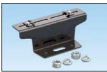
FR6CS12 FR6CS58 FR6CS12M FR6CS58M