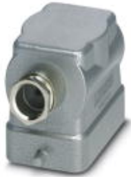
HEAVYCON B6 sleeve housing, for single locking latch, height: 56 mm, with 1 x M20 screw connection, lateral cable outlet

Please be informed that the data shown in this PDF Document is generated from our Online Catalog. Please find the complete data in the user's documentation. Our General Terms of Use for Downloads are valid ( http://download.phoenixcontact.com )