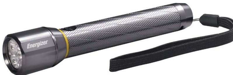
Tested according to ANSI/NEMA FL1 Standards. Results based on: Energizer, MAX, Alkaline / E91