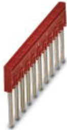
Plug-in bridge, pitch: 6.2 mm, number of positions: 10, color: red

Please be informed that the data shown in this PDF Document is generated from our Online Catalog. Please find the complete data in the user's documentation. Our General Terms of Use for Downloads are valid ( http://phoenixcontact.com/download )