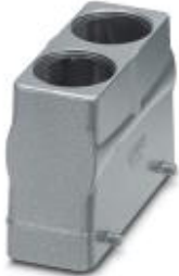
HEAVYCON B24 sleeve housing, for double locking latch, height: 76 mm, with 2 x M40 thread, straight cable outlet

Please be informed that the data shown in this PDF Document is generated from our Online Catalog. Please find the complete data in the user's documentation. Our General Terms of Use for Downloads are valid ( http://phoenixcontact.com/download )