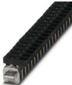
Connection terminal block, Connection method Screw connection, Load current : 41 A, Cross section: 0.5 mm 2 - 6 mm 2 , Width: 7 mm, Color: green

Please be informed that the data shown in this PDF Document is generated from our Online Catalog. Please find the complete data in the user's documentation. Our General Terms of Use for Downloads are valid ( http://phoenixcontact.com/download )