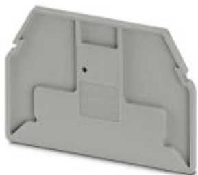
End cover, length: 53.3 mm, width: 2.2 mm, height: 37 mm, color: gray

Please be informed that the data shown in this PDF Document is generated from our Online Catalog. Please find the complete data in the user's documentation. Our General Terms of Use for Downloads are valid ( http://phoenixcontact.com/download )