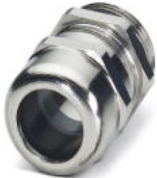
Cable gland, Cable gland material: Brass, nickel-plated, External cable diameter 34 mm ... 44 mm, Shielding: No, Connecting thread: M63, Color: silver

Please be informed that the data shown in this PDF Document is generated from our Online Catalog. Please find the complete data in the user's documentation. Our General Terms of Use for Downloads are valid ( http://phoenixcontact.com/download )