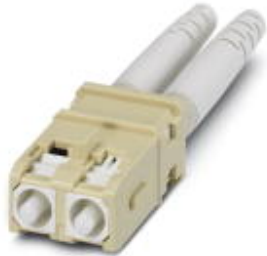
SC-RJ connector, with long bend protection, for multi-mode 50/125 µm, beige

Please be informed that the data shown in this PDF Document is generated from our Online Catalog. Please find the complete data in the user's documentation. Our General Terms of Use for Downloads are valid ( http://phoenixcontact.com/download )