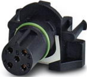
Sensor/actuator flush-type socket, 5-pos., shielded, B-coded, with straight solder connection, only contact insert

Please be informed that the data shown in this PDF Document is generated from our Online Catalog. Please find the complete data in the user's documentation. Our General Terms of Use for Downloads are valid ( http://download.phoenixcontact.com )